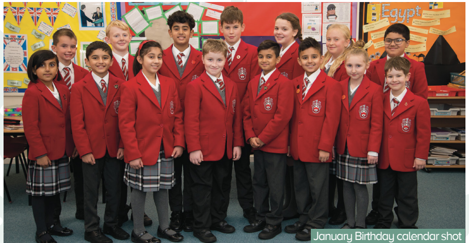
January Birthday calendar shot